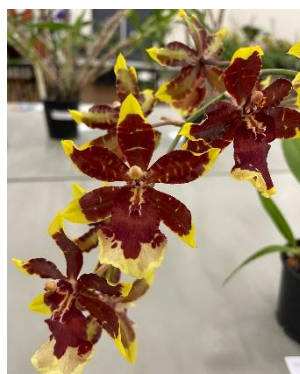
Onc. Wildcat 'Red Star' Lynn Dabbs