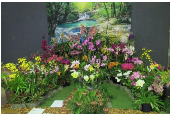
Species Orchid Society