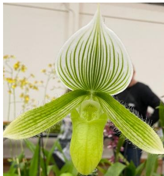
Paph. Lime Fresh 'Invidia' Rod Nurthen