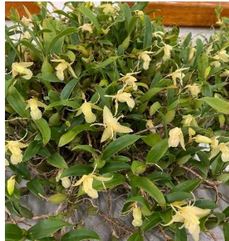
Coel. fimbriata var. alba Cary Polis