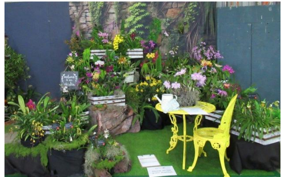
Blue Mountains & Penrith O S