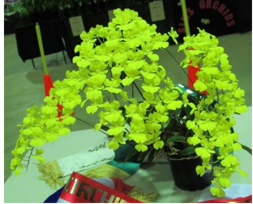
Grand Champion Species Champion Oncidiinae Zelenkoa onusta owned by V Clowes