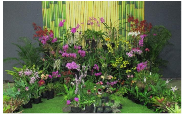
Hawkesbury District Orchid Society