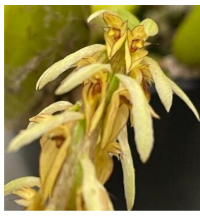
Bulb. longibracteatum Cary Polis