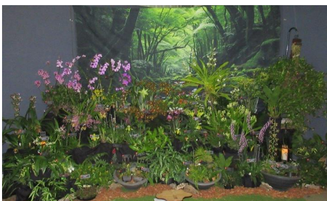
Blacktown Orchid Society