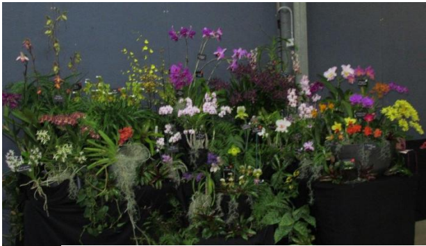
Friends of OSNSW