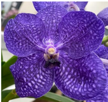
V. Pakchong Blue Lina Huang