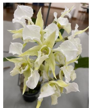
Den. forbesii Li Shan