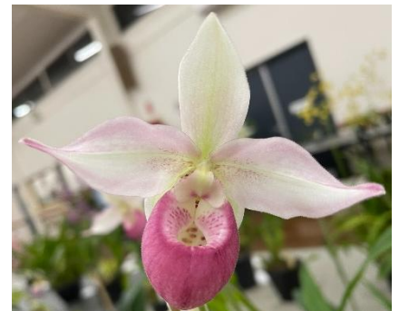
Phrag. Cardinale Li Shan