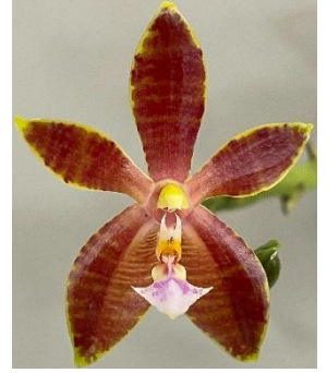
Phal. Eiderstedt Cary Polis