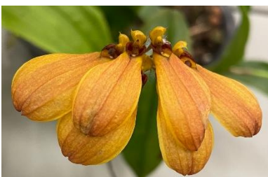
Bulb. mastersianum Cary Polis