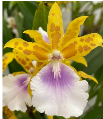
Milt. Goodale Moir x Golden Wonder Mary Drummond