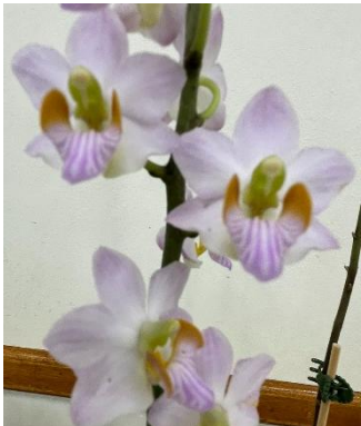
Phal. pulcherrima