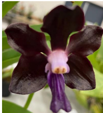
V. Tilda Lungren 'Midnight Special' Cary Polis