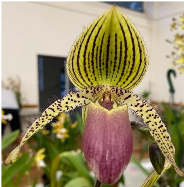
Paph. Vanguard Li Shan