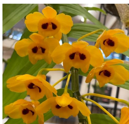
Den. chrysanthum Dora Law