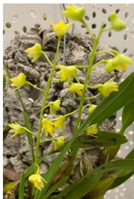
Den. monophyllum Lynn Dabbs