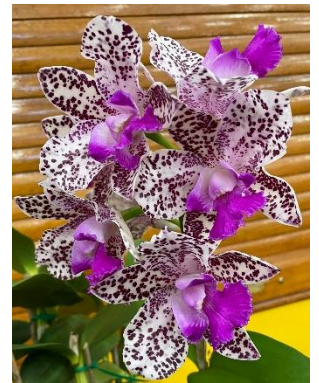
C. Caudebec Candy 'Nicole'