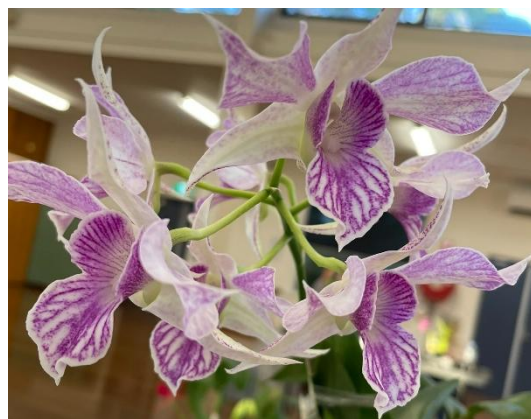
Den. Silver King Ela Kielich