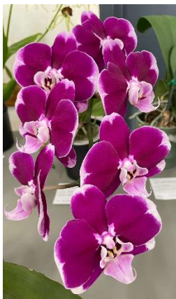
Phal. Hwa Yuan 'Five Star' B Wong & R Terrenal