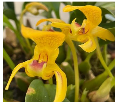
Bulb. dearei Cary Polis