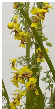
Lockhartia sp.