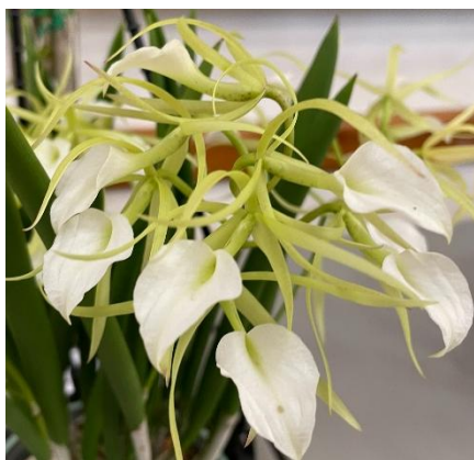
Brassavola Little Stars Lina Huang