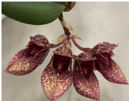
Bulb. frostii C Scott-Harden