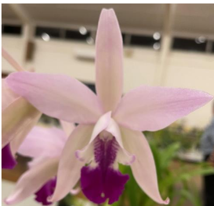
Cattleya Valkyrie Robin Stewart