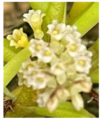
Schoenorchis micrantha