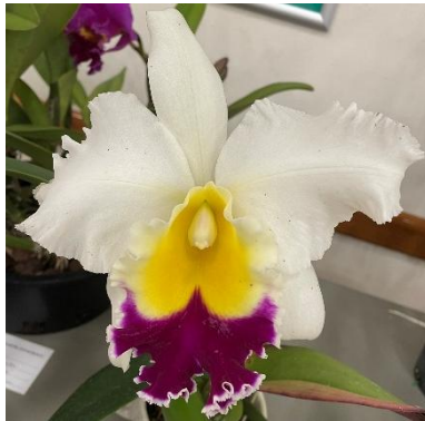
Rlc. Song Khwae Gold '#2' Cary Polis