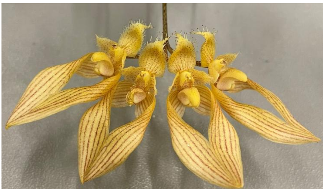
Bulb. annandelei Li Shan