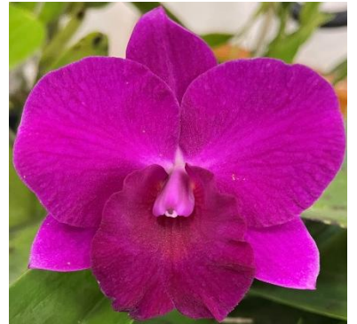
C. Swig of Brandy 'Good Drop' L & G Bromley