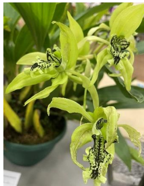
Coel. pandurata Cary Polis