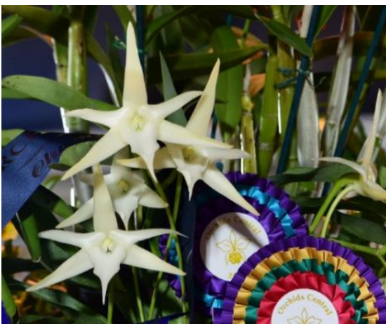
Best in Show Grand Champion Species Ang. sesquipedale Owned by J Gafa