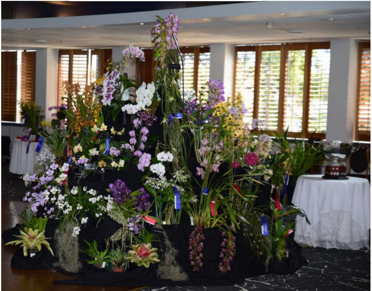
Bankstown Orchid Society with the Sanders Cup