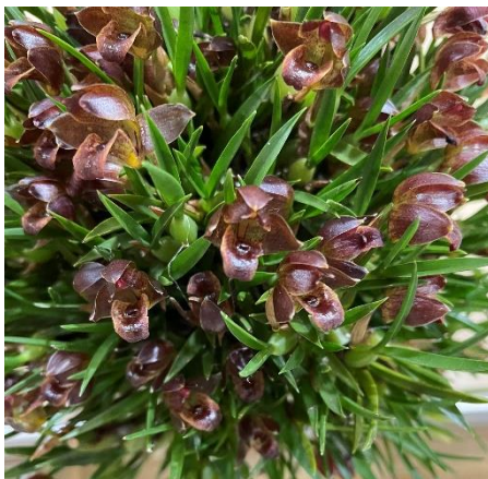
Best of the Evening Open (50% culture/50% flower) Max. paranaensis Owned by Cary Polis