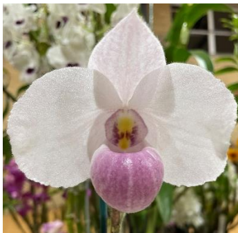
Paph. delenatii 'Coconut Ice' Rod Nurthen