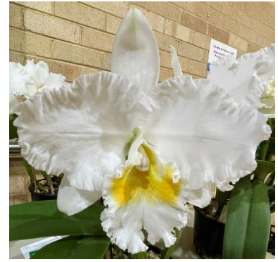
C. Lyn Spencer 'Pearl' G & A Cushway