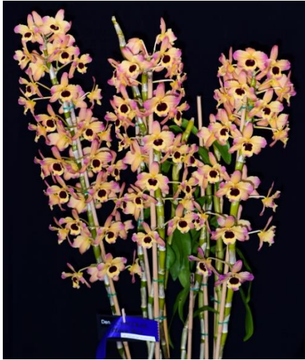
Champion Dendrobium Hybrid Den. Glade View 'Sunset' D & K Mitsios