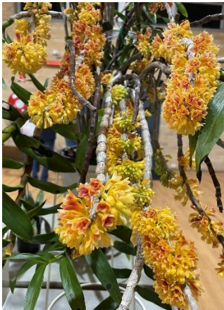
Den. x usitae 'Red Coral' Ela Kielich