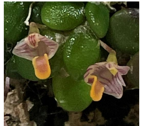
Den. lichenastrum Cary Polis