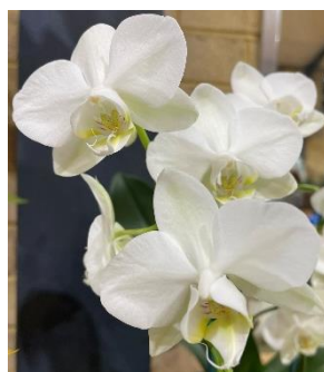
Phal. Unknown Iona Luke