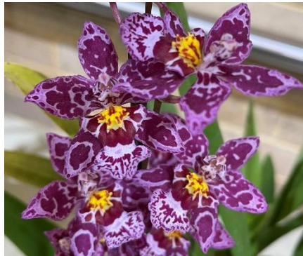
Cyrtocidium Kolibri Elizabeth Blackwell