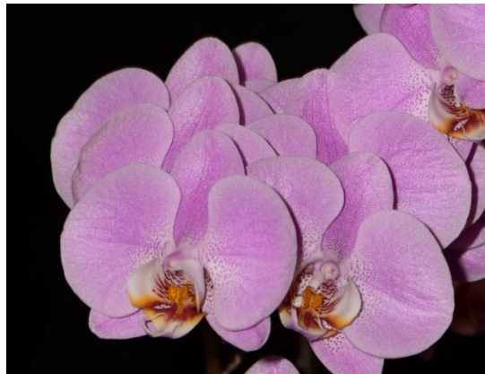
Champion Monopodial Hybrid Phal. Cadillac D Webb