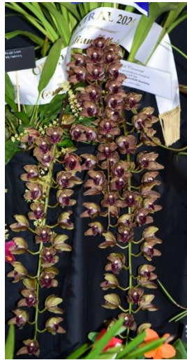
Champion Cymbidium Cym. Plush Canyon 'Beenak' M Zanelich