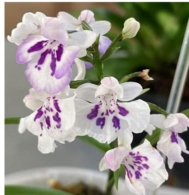
Ponerorchis graminifolia