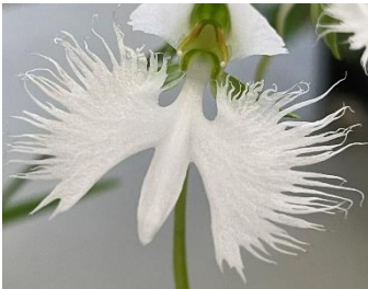
Harbenaria radiata