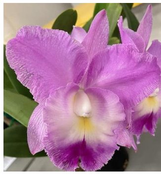
C. Hawaiian Heatwave