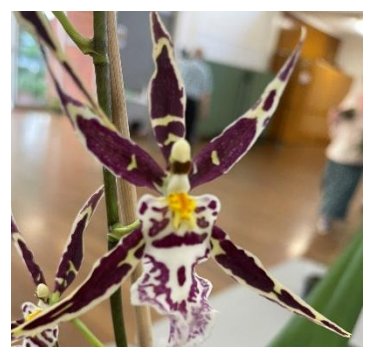
Brsdm. Golden Gamine E Blackwell