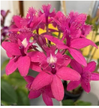
Epi. (Magenta x Royale) Cary Polis