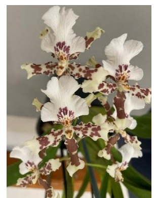
Onc. Speckled Spire 'Shorty' Lina Huang