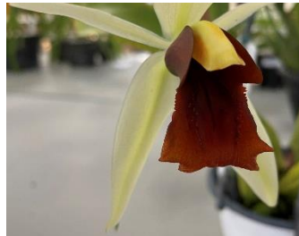
Coel. Bird in Flight Cary Polis