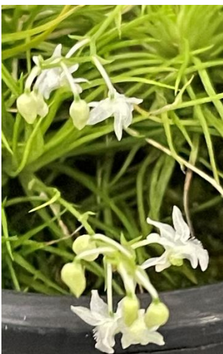
Phymatidium tillandsioides