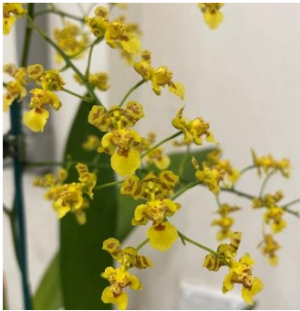
Onc. trulliferum