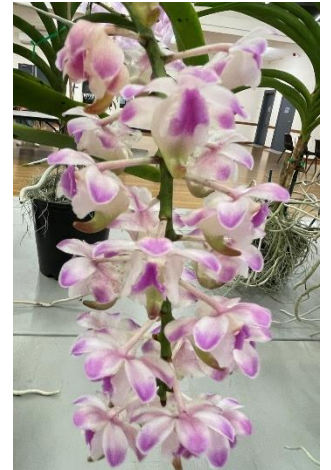
Aer. lawrenceae