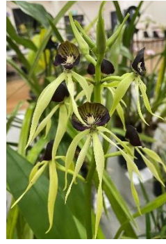
Prosthechea cochleata Tinka Riddell