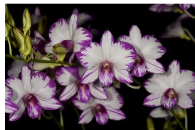
Den. Enobi Purple 'Splash' (Trevor's plant)