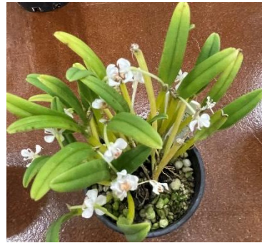
Cadetia taylorii