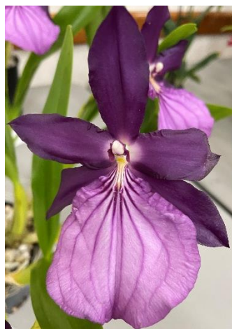
Milt. spectabilis var. moreliana 'Big Ben'