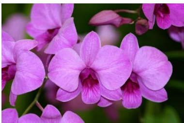
Den. Enobi Purple