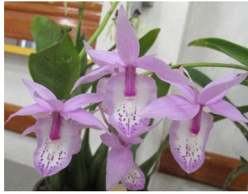
Barkeria spectabilis Cary Polis