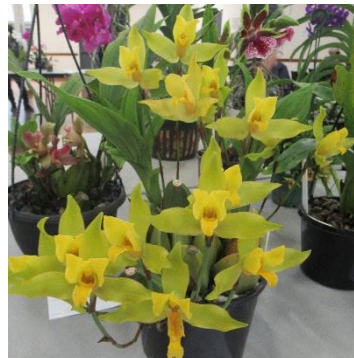
Lyc. Groganii