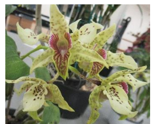
Den. normanbyense x Wonder Nishii