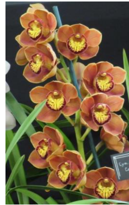
Cym. Atlantic Carat 'No 1' Owned by G Serhan