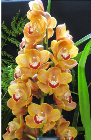
Cym. Egyptian Sunrise 'Super Orange' Owned by G Serhan