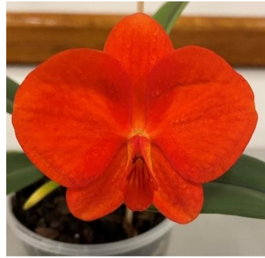
C. coccinea Seong Tay