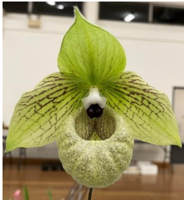
Paph. malipoense Rod Nurthen