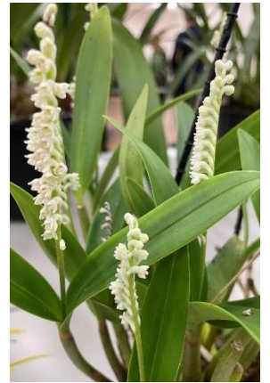
Pinalia spicata