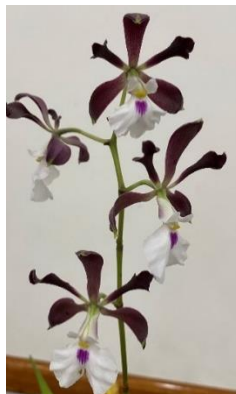
Enc. cordigera