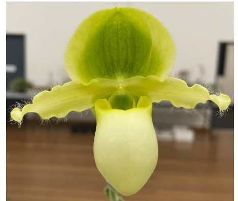
Paph. primulinum Seong Tay