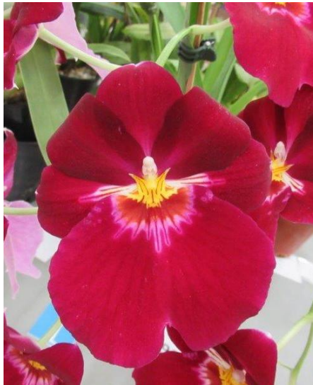
Mps. Bert Fields 'Leash' Owned by Rod Nurthen