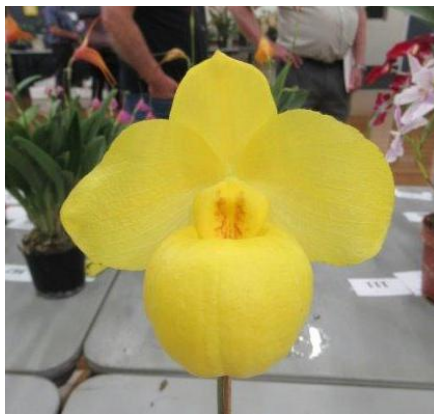
Paph. armeniaceum Owned by Seong Tay