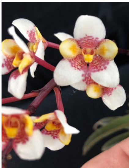
Sarco. Kulnura Maestro 'Jackpot'