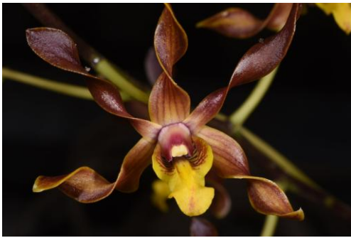
Den. Dark Dame x johannis