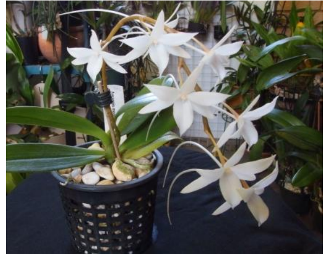
Aerangis modesta Owned by Ela Kielich