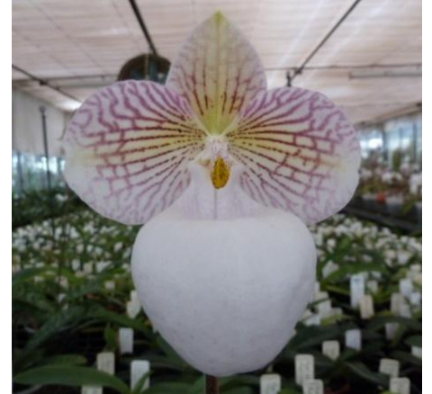
Paph. micranthum var eburneum