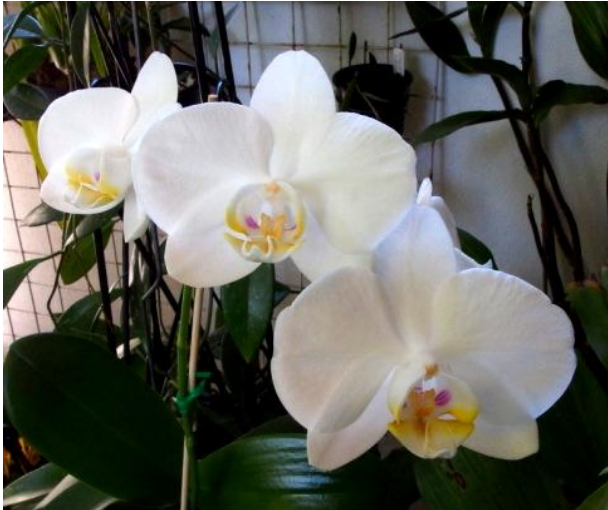
Phal amabilis Owned by Ela Keilich