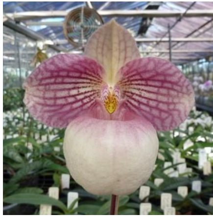
Paph. Liberty Taiwan