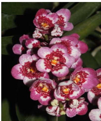
Sarco. Kulnura Now 'Dreamer' AM