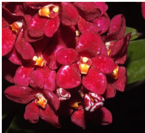
Sarco. Kulnura Momentum 'Marble' AM