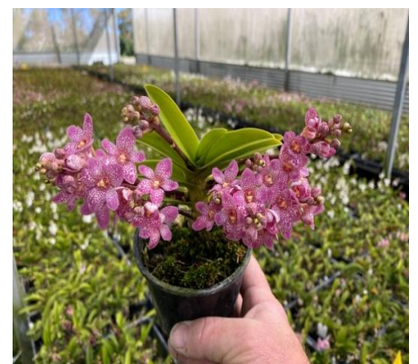
Sarco. Kulnura Secure x Kulnura Pass