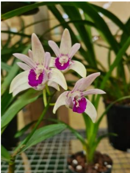
Den. Australian Obsession x Hamilton