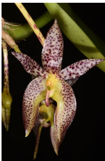
Bulb affine x macranthum