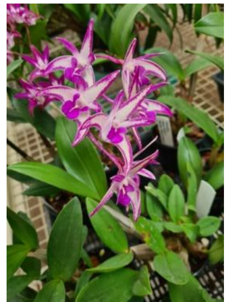
Den. Bounty x Starsheen