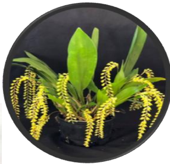
Ddc. cobbianum Owned by Warleiti Jap