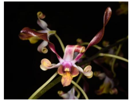
Den. Dark Dame x carroni