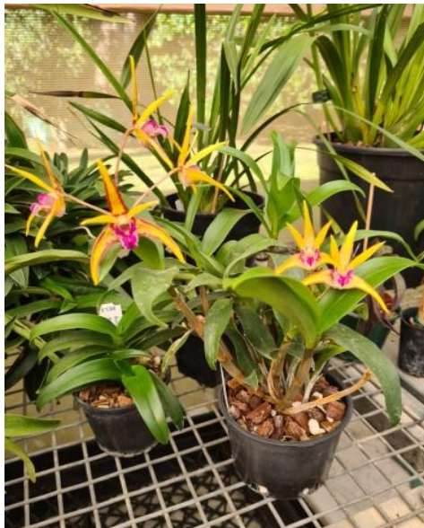
Den. Rutherford Starburst 'Tinonee'