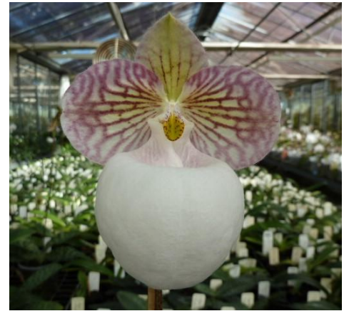
Paph. micranthum var eburneum 'Clover'