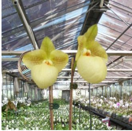
Paph. Fumi's Delight 'Apricot Cream'