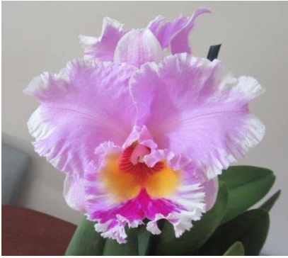
Rlc. Burdekin Heights 'Rosella'