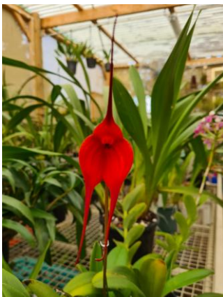
Masd. Bay of Fires 'Crown Vista' Owner Susie Butler