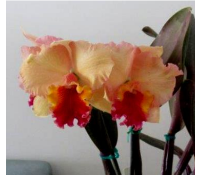
Cattleya Mishima Flare 'Royal'