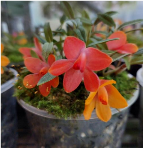
Den. cuthbertsonii Owned by Seong Tay

Dendrobium cuthbertsonii is a cool growing species from Papua New Guinea. This diminutive gem of the orchid world is, I think responsible for more excitement and yet more disappointment than just about any other species. Tiny plants no more than about 8cm tall, with proportionately enormous blooms bulging over the sides of the warty coriaceous leaves. The plants are a deep dull green colour and are totally upstaged by the stunning vibrant colours of the flowers, ranging from the most common red to orange, purple, pink, whites and yellows. And even bicolour types using combinations of these colours, all this in a plant that can be grown in a 5cm pot. They range in elevation from about 1000 metres to 3700metres and live in a variety of habitats. Starting from the lower elevations they tend to be terrestrial, They can be found on the edges of road cuttings growing on the embankments in full sun with their roots burrowing into the clay to a depth of about 8cm, here they predominate, the