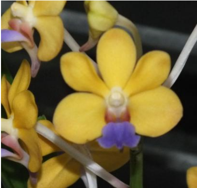
Van. Seng x V. testacea