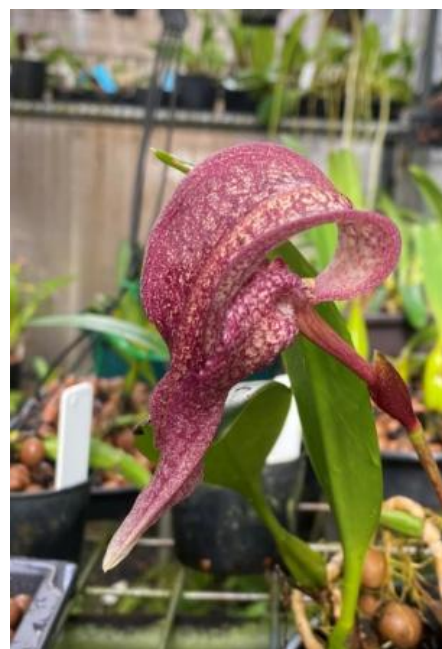
Bulb. fritillariflorum Owned by I & I Chalmers