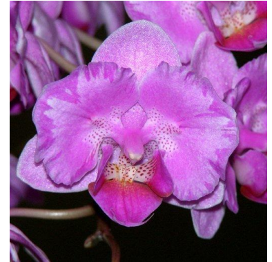
Phal. Little Mary 'Cherry Blossom'