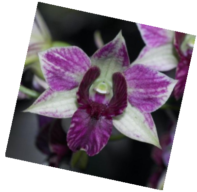
Den. Foundry Salad Bowl