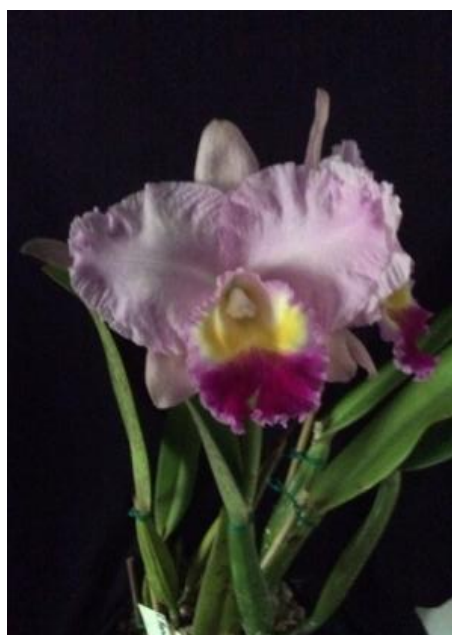
C. Horace 'Maxima' Owned bby Gloria & Allan Cushway

This is a cool growing species from Mexico and the Costa Rica areas between North and South America. It is free flowering and the clear white flowers are on stems held nicely above the foliage. They grow happily in bush-houses in Sydney needing no special attention. They are in the Oncidiinae family and until recently were called Osmoglossum. They seem to grow happily in most potting mixes. Ours grow in a peat and perlite mix and are fertilized regularly with a weak mix along with all the other orchids in the bush-house. This is an excellent orchid for novice growers.