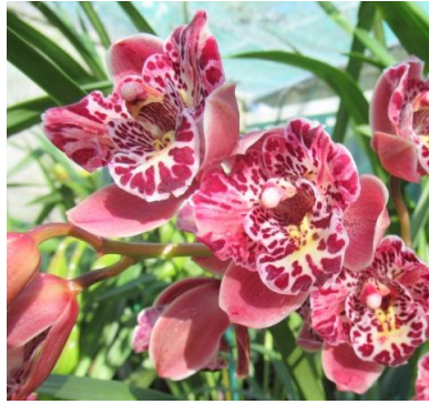
Cym. Strathdon 'Corksbridge Fantasy'