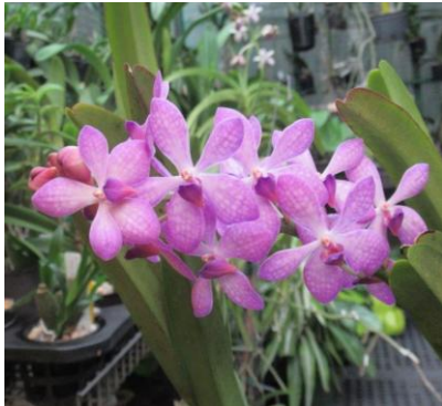
Porterara Blue Boy 'Jill' Owned by L & G Bromley