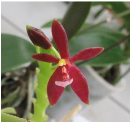
Phal. cornu-cervi 'Red' Owned by Cary Polis