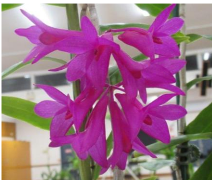
Dendrobium glomeratum Owned by Ea Kielich