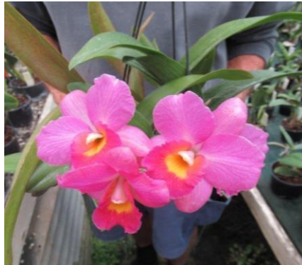
Gct. Sip of Brandy 'Triumph' Owned by Bruce Wood