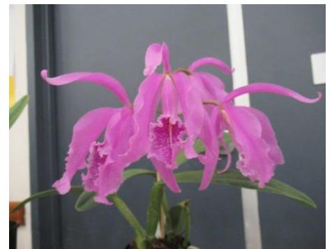
C. maxima Owned by Cary Polis