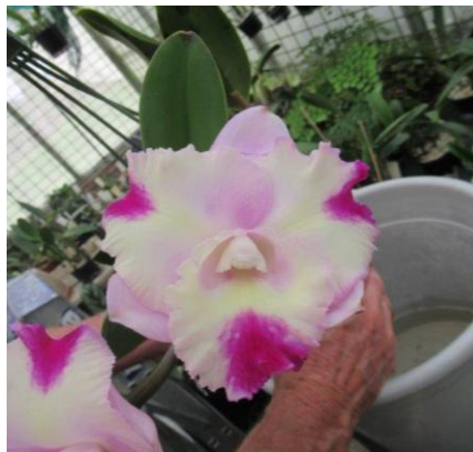
Rlc. Dal's Charm 'Lakehaven' Owned by Bruce Wood