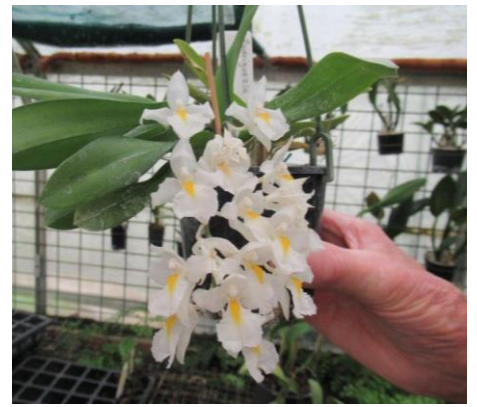
Rodriguezia venusta Owned by Bruce Wood