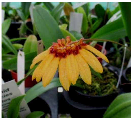
Bulb. Surat Worawongwasu