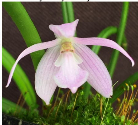
Leptotes unicolor Owned by Orchid Species Plus