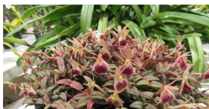
Champion Specimen Epidendrum porpax Owned by Cary Polie