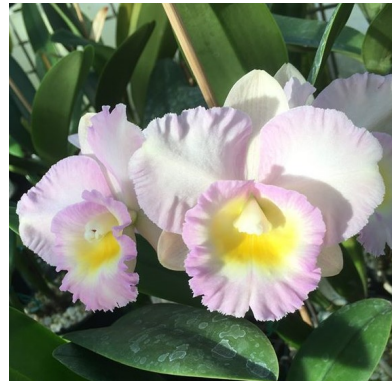
Rlc. Lakehaven Pearl 'Colleen' Owned by Bruce Wood