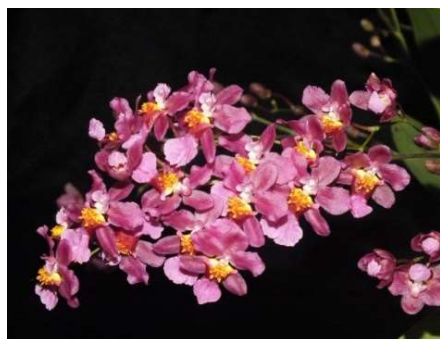
Oncsa , Trinket 'Good One' Owned by L & G Bromley