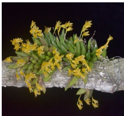
Pleurothallis leptotifolia Owned by Jody Cutajar