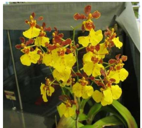
Champion Oncidium All. Oncsa. Sweet Sugar Owned by Ela Kielich