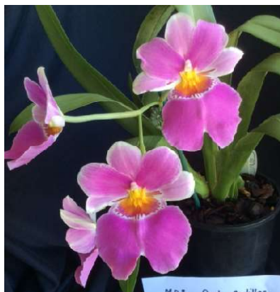
Mps. Pink Cadillac Owned by G & A Cushway