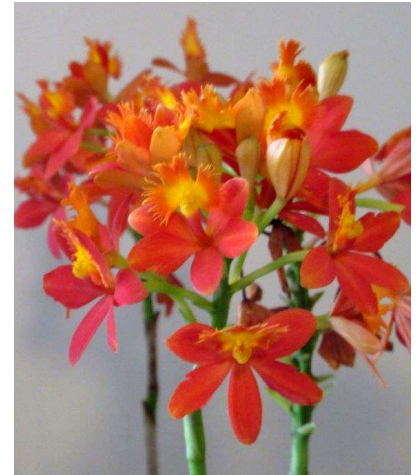
Epidendrum (Epi.) Pacific Girl