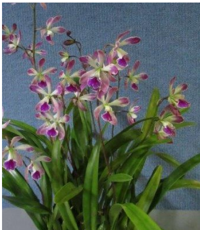
Catyclia (Cty.) Burdekin Honey 'Shona'