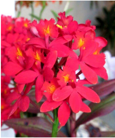
Epidendrum Hokulea 'Super Red'