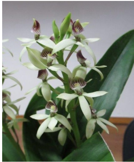
Prosthechea (Psh.) trulla