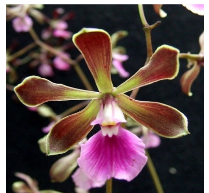
Encyclia (E.) Atropine

Please note, we try and update the correct genera for your orchids as they are reclassified, that is why all the purpurata are now cattleyas and not laelia and your Doritaenopsis are now all Phalaenopsis. And stay tuned there are still more changes to come.