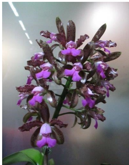
Cattleya (C.) leopoldii