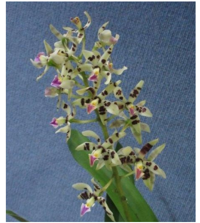
Prosthechea prismatocarpa 'Galaxy'