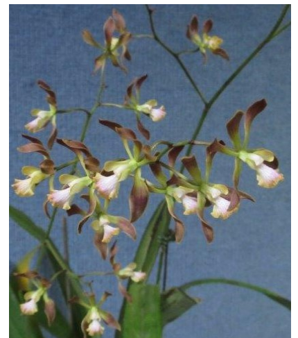
Encyclia (E.) Bees' Knees