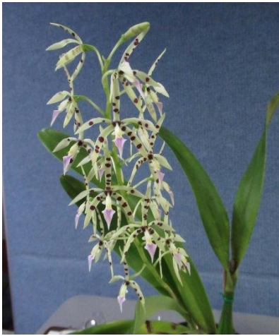
Prosthechea (Psh.) prismatocarpa

These are some of the orchids which flower at this time of the year, many were benched at our January meeting