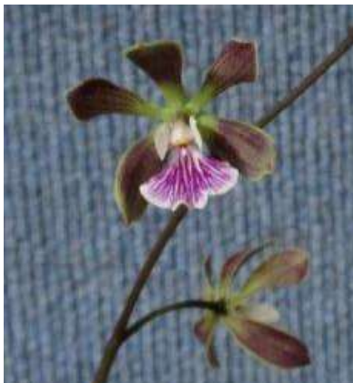
Encyclia (E.) Burdekin Bubble Bee

Please note, we try and update the correct genera for your orchids as they are reclassified, that is why all the purpurata are now cattleyas and not laelia and your Doritaenopsis are now all Phalaenopsis. And stay tuned there are still more changes to come.